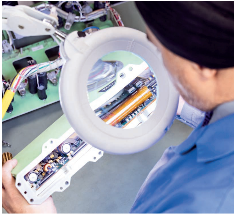
Ontic, a manufacturer of OEM-licensed parts for legacy aircraft, has grown its revenue by almost $210 million under nearly 13 years of ownership by BBA Aviation.

Cheltenham, UK-based Ontic supports more than 39,000 on-service aircraft through a portfolio of more than 165 licenses to manufacture more than 7,000 parts. It has more than 1,200 customers and manufacturing and repair facilities in Chatsworth, California; Creedmoor, North Carolina; Plainview, New York; Cheltenham; and Singapore. About 55 percent of Ontic's revenue comes from military aviation with another 40 percent from commercial aviation, Hall said. Business and general aviation make up the remainder of its revenue, according to Hall.